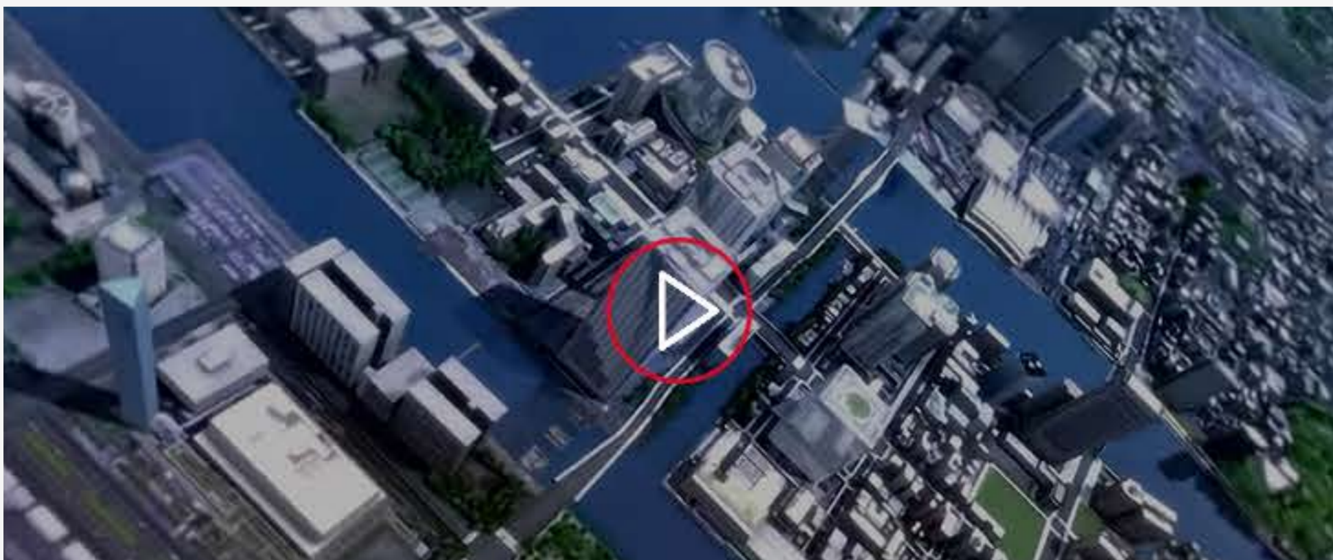
KYB Global Overview 2015

Lorem ipsum dolor sit amet, consectetur adipiscing elit, sed do eiusmod tempor incididunt ut labore et dolore magna aliqua. Ut reprehenderit in voluptate velit esse cillum dolore eu fugiat nulla pariatur.