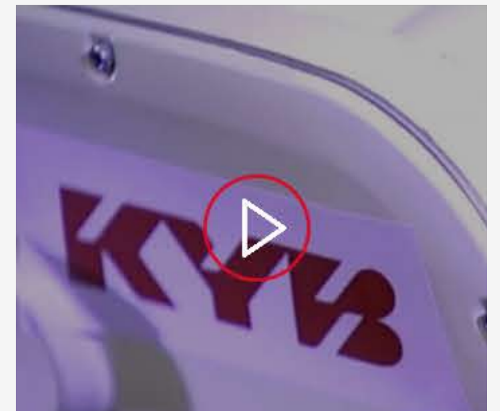
A Snapshot of KYB